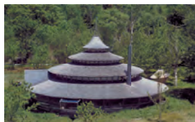
Home Work: Handbuilt Shelter page 29 The first 54' tricentric yurt at the Mountain Institute, Cherry Grove, West Virginia, USA, 1976