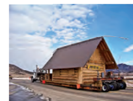
Tiny Homes: Simple Shelter page 90 Montana Mobile Cabins, Kip and Dawdi Keim's business based in Whitehall, Montana, USA