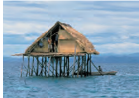
Home Work: Handbuilt Shelter page 102 House of the Bajau people, Manado, northern Sulawesi Island, Indonesia