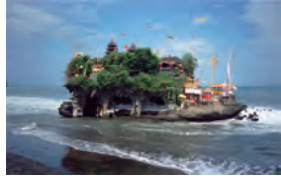
Home Work: Handbuilt Shelter pages 110-111 Temple Island, Bali