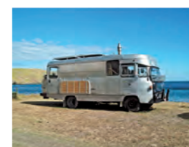
Tiny Homes: Simple Shelter page 170 'The Flying Tortoise', 1977 Bedford bus built in New Zealand by Hawke Coach-builders and converted into a home by Keith Levy in 2007