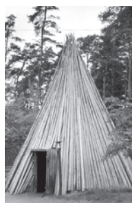
Shelter page 9 Ancient Latvian summer kitchen 'Slietenis', Latvian Ethnographic Museum, Riga, Latvia (former USSR)