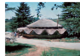
Home Work: Handbuilt Shelter page 28 Bill Coperthwaite's yurt in the Maine woods, USA