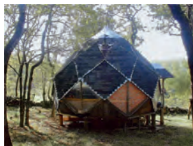
Home Work: Handbuilt Shelter page 48 Zome with diamond motif in meadow, Pyrenees, France