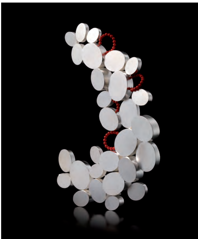
Brooch in the Artery Series Silver and red beads 6cm x 14cm