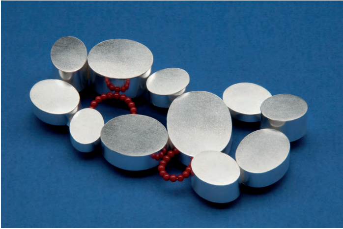
Brooch in the Artery Series Silver and red beads, 9x4.5cm