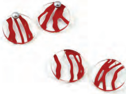
Stud Earrings from the Artery Series Acrylic & red pigment, silver posts topped w pearls, 2009 3.2x3.2cm