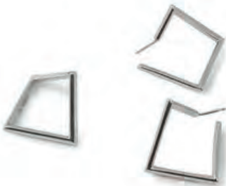
Cube ring & earrings Silver, 2004 2x2cm